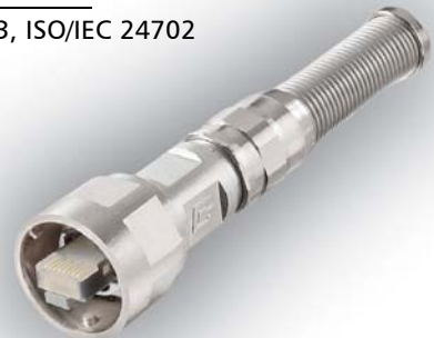
#1401400810-I field plug insert for IP67 rated RJ45 (optional) according to ISO/IEC 24702 ISO 61076-3-106, variant 1